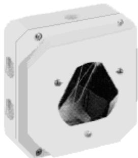
Prism Reflector (Model PBR-1191)

The retroreflecting prism of Model PBA-1191 has the shape of a pyramid whose lateral faces are formed by isosceles orthogonal triangles. Light entering through the base is completely reflected twice on the lateral faces and reflected back through the base. The base is equipped with a reflector heater. If condensation is possible, the heater should be connected to a 24V supply.