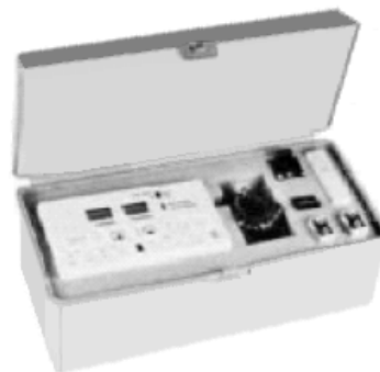
Detector Adjustment Kit (Model PBL-1191)

The detector adjustment kit (Model PBL-1191) is required for proper electrical adjustment and mechanical alignment of Model PBA-1191.